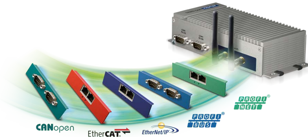
Figure 1 - This industrial PC can be easily customized for the intended application by adding a range of standard networking and other features, all without modifying the internals of the computer.

As a means of providing highly customized solutions without modifying the guts of an IPC, iDoor Technology presages a trend in IPC implementation. Using standardized components and interfaces allows the automation platform, and therefore the integrator, to leverage current state-of-the-art technologies as well as up and coming IPC trends. Other added benefits include, the ability to develop your own MiniPCIe card, your own exclusive iDoor Technology functions, and even iDoor shell colors (such as combining your company logo).